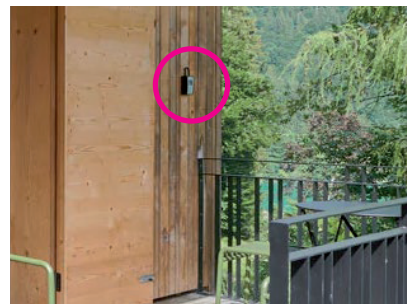
6 Schlüsselbox (Terasse)