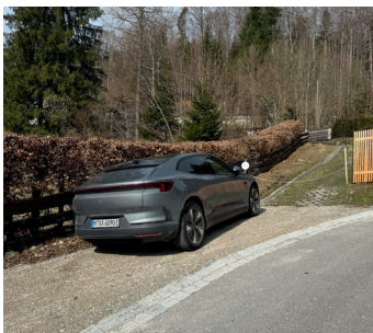
5 Parken, 2 Stellplätze