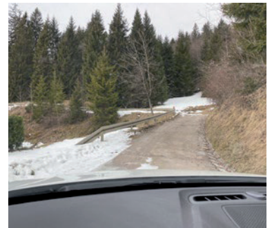
4 Weg nach oben neu geteert